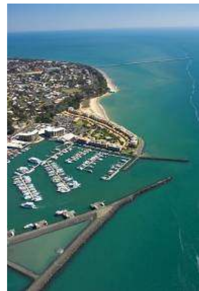
Hervey Bay, Queensland

We wish Verchovyna every success at the Festival and we congratulate you in continuing to educate the broader Australian community about Ukrainian culture through dance.